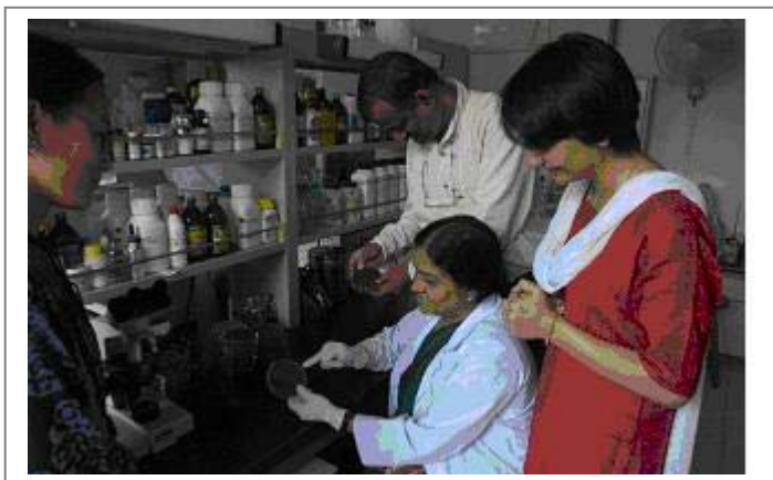
Nepal Reference Laboratory Thribhuvan University

Binax and Latex rapid test results for CSF and improved blood cultures procedures improved