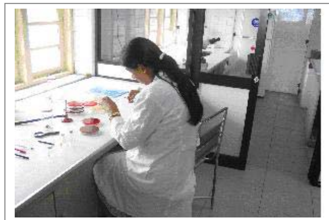
Modified Microbiology Laboratory at Lady Ridgeway Hospital

the clinical management of sick patients in hospitals. All blood cultures in LRH are now using sheep blood media, and current data shows the success of this policy.